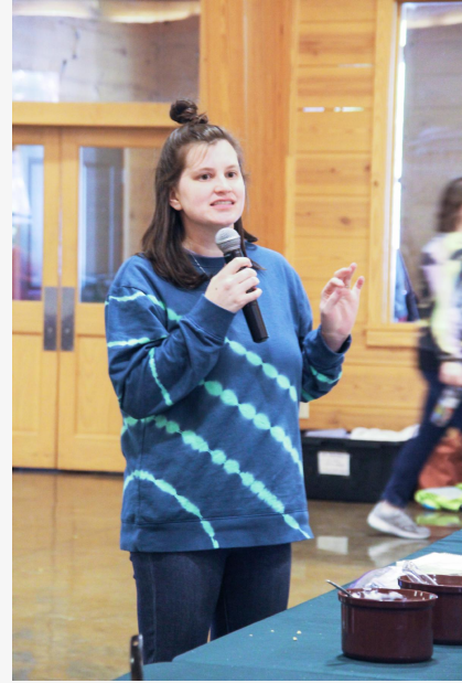
Conference Chair addresses the attendees at Camp McDowell.