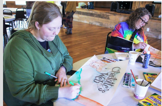
Workshop attendees flex their creative muscles!