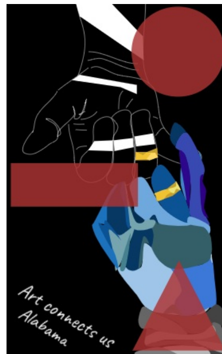
Middle Grades Winner