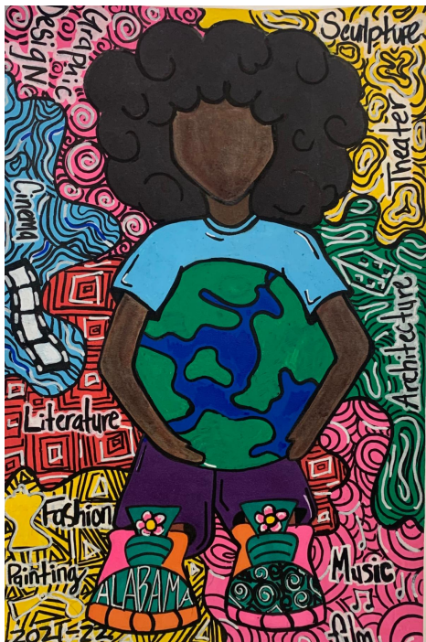
High School Winner